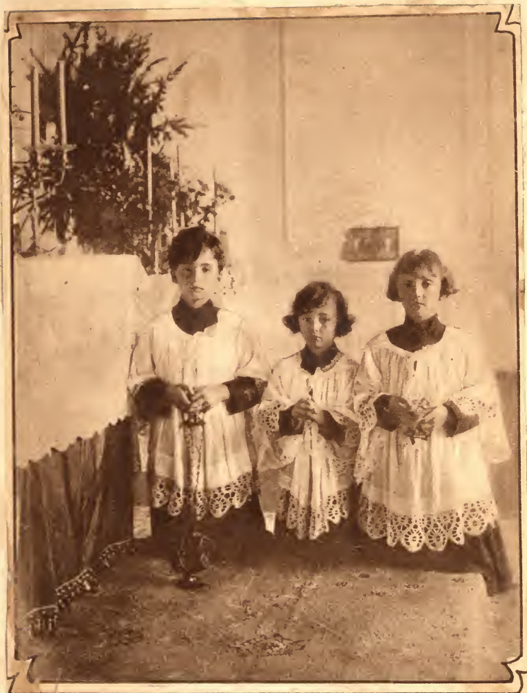
The Archduke Otto of Austria and Heir to the Title of Emperor of Austria (Left), with His Brothers, the Archdukes Felix and Robert, Serving at the Altar in the House Where They Are in Exile in Spain.